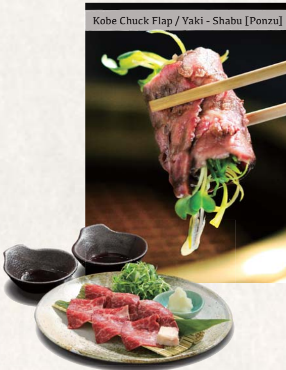
Kobe Chuck Flap / Yaki - Shabu [Ponzu]

A famous dish with over 60 years of heritage. Its spicy flavor along with crisp, freshly cut onions will leave you wanting more. Truly, a one-of-a-kind experience you can only partake in at Manpuku.